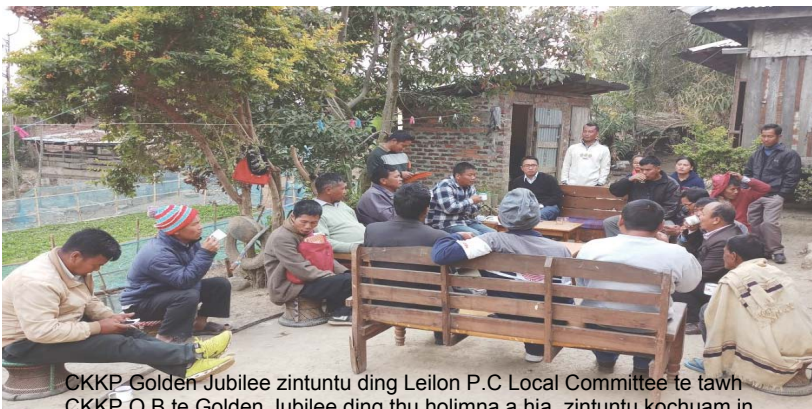
CKKP Golden Jubilee zintuntu ding Leilon P.C Local Committee te tawh CKKP O.B te Golden Jubilee ding thu holimna a hia, zintuntu kochuam in Jubilee lawpna ah Sial khat leh Vok khat tuak ding ahiu.

Pathian lem tipi kinem ah ahungtung ding January 2019 ah Leilon PC ah CKKP in Golden Jubilee lawp ding ah thupukna ala umsa bawzui na ah Committee in theitawp sua ah pan alak nate chu chia zawm zel in, maban kinem umtak tawh ma hawitak in asawn zel ui. Jubilee ading ah nu leh pa tawmngai tak takte beploh ah Khrista ah Khanglai tawmngai tak tak te lak ah Ginna thutiam ala bawl uchu sunzawm to zel in tu leh tu dinmun ahin atamzaw phial in Pathian hatna suang ah akitep teu asu buting to zel tau ti thu dawn ahi. Zia bep chu hilo in, ala kitiam khalo Khanglai tawmngai taktak te apat in le kitep lawk um sese lo in, ahiaht hiat ua asum ah thei dan chiat ah pelut ziang le hunkhawp aum un, Lawi upate thathaw tu poimaw mama in apang ui ti thu le dawn ahi. Thu dawn na chun, Sadar District lam ah nu leh pa te tawmngaina leh dawisakna thupi mama hi'n le agen hi. Pathian min lopi na ding ah thei dan chiat ah apang nailo te le pang zawm zelding in lawi upa lam apat in ngekna a um hi. Chun, Golden Jubilee ading ah Sub Committee chuamchuam te'n le pan hawitak ah alak to ziak un CKKP chun lungdam thu apuang bawh hi.