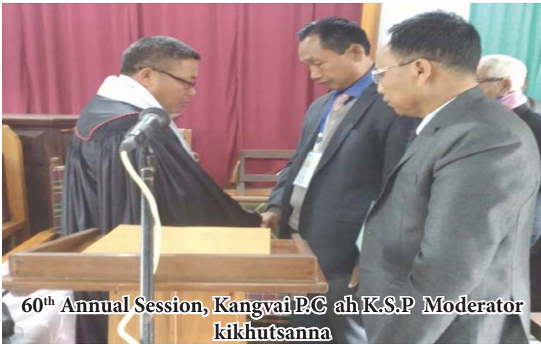
60 th Annual Session, Kangvai P.C ah K.S.P Moderator kikhutsanna